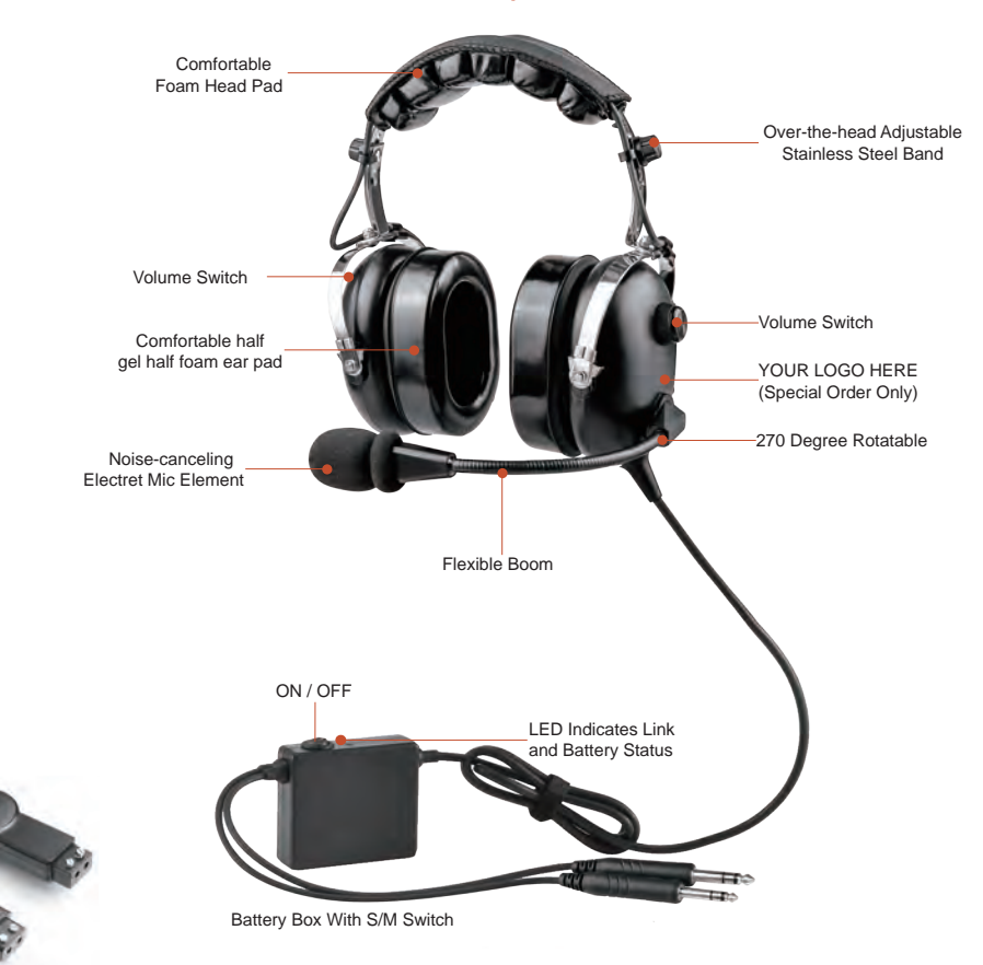
Dynamic or Electret Microphone for Flexible Boom

Flexible Boom for Perfect Microphone Placement