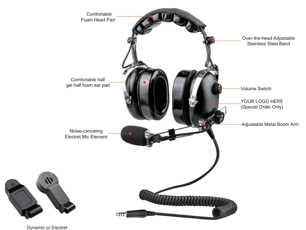
Microphone for Metal Boom

Adjustable Metal Boom with 360 Degree Rotational for Left or Right Side