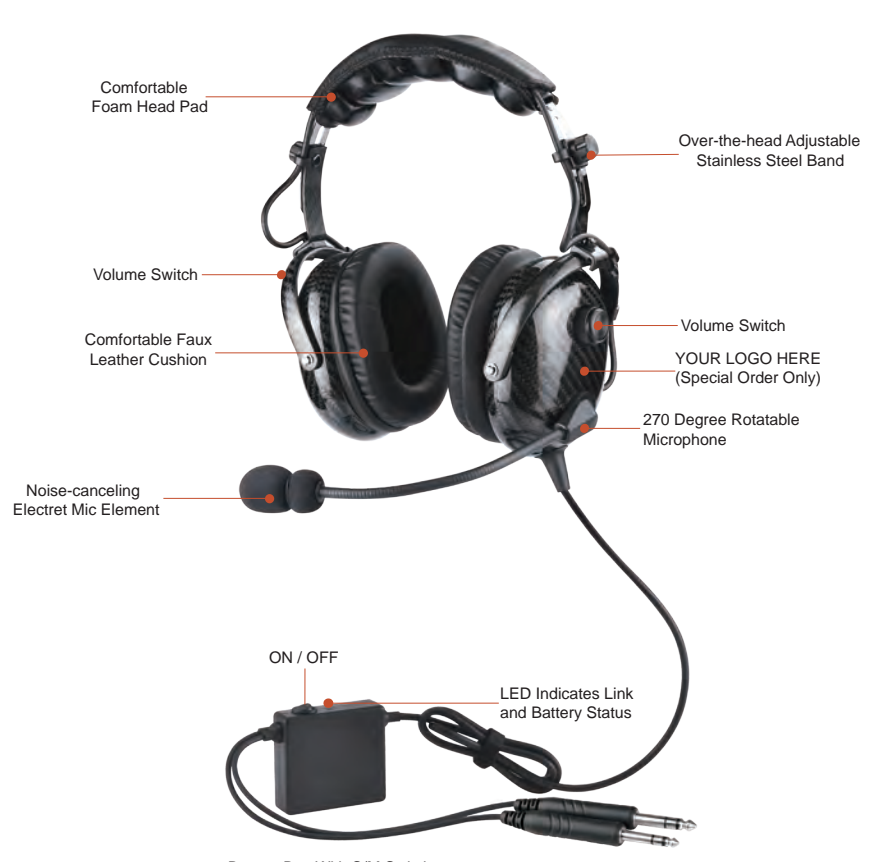
Battery Box With S/M Switch