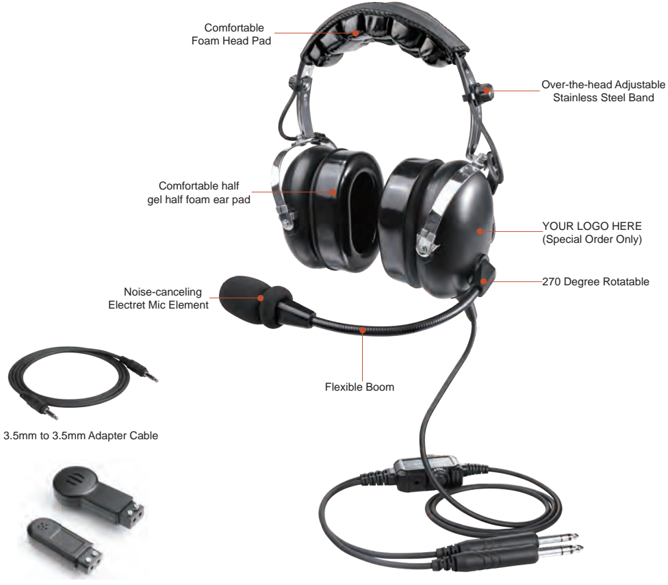
Dynamic or Electret Microphone for Flexible Boom

Flexible Boom for Perfect Microphone Placement