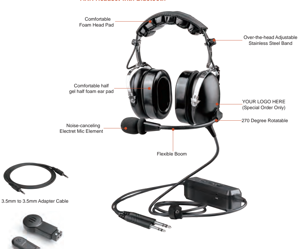
Dynamic or Electret Microphone for Flexible Boom